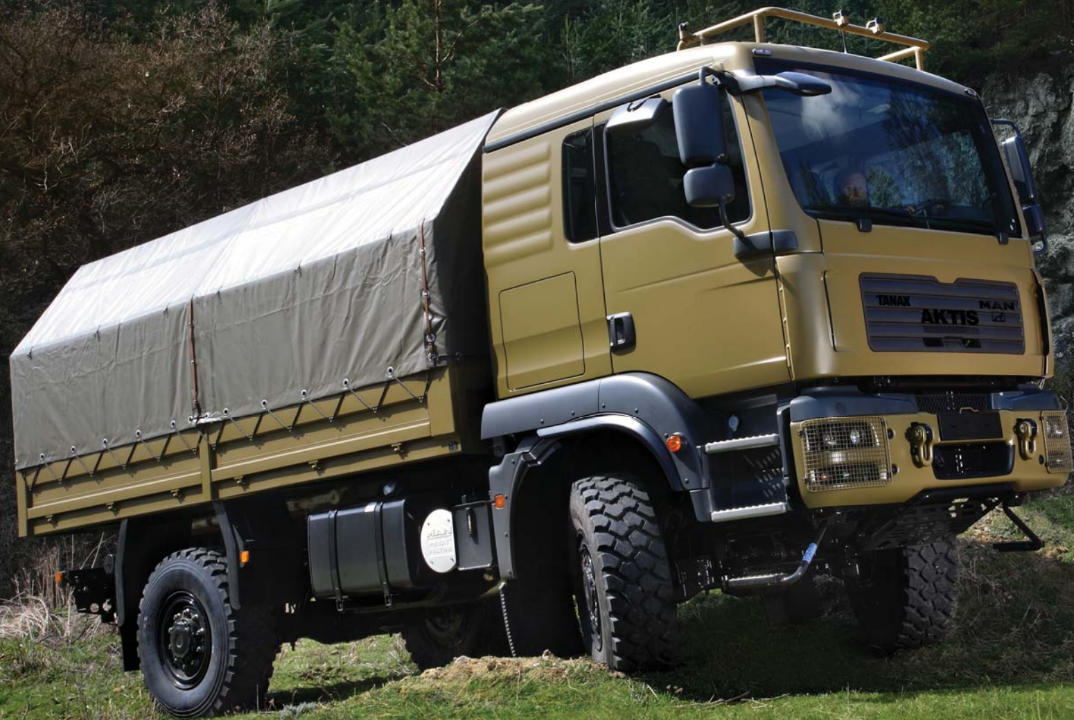
AKTIS 4x4.1R-08 MEDIUM TRUCK